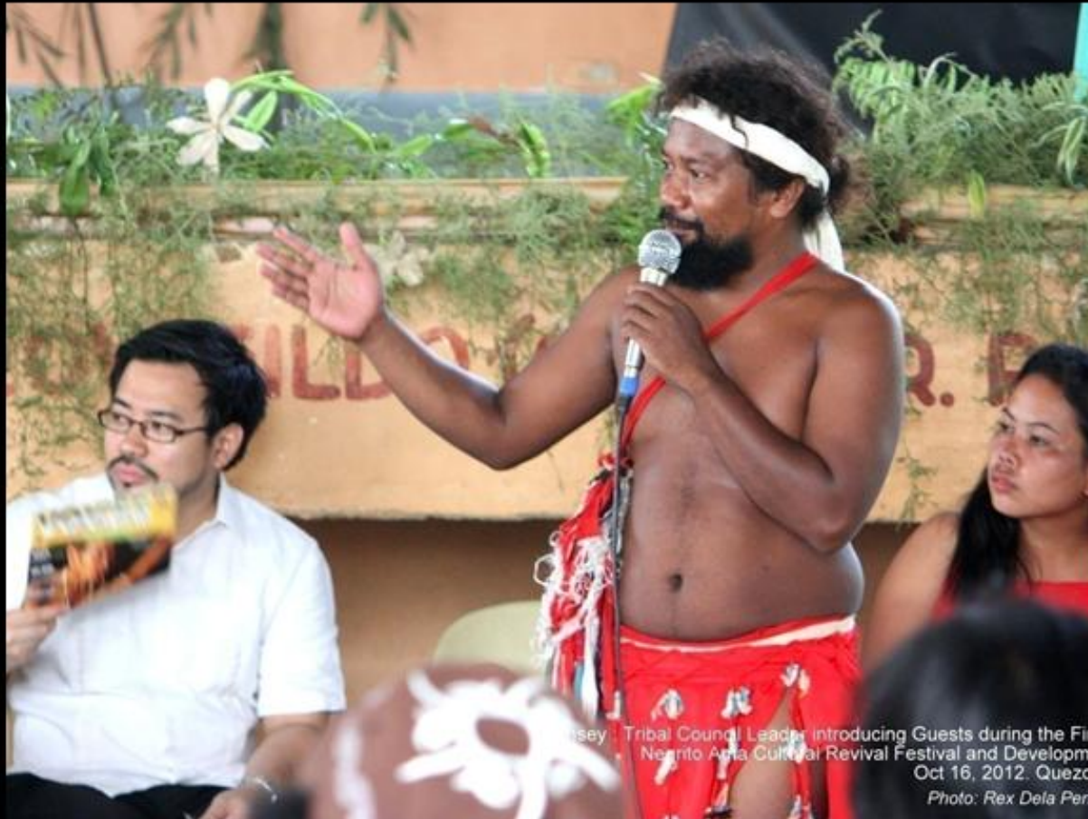
...sey Tribal Council Leader introducing Guests during the First Negrito Arts Cultural Revival Festival and Developme Oct 16, 2012. Quezon